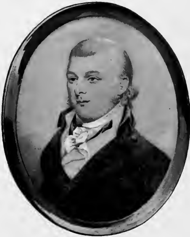
Tench Francis By James Peale Page 127